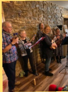
Tockholes WI Summer Party on Thursday 29th September at The Royal Arms with Mellor Brook Ukelele Band raising money for North West Air Ambulance