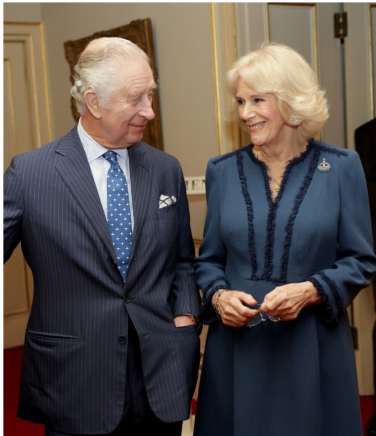
Official image to mark the Coronation